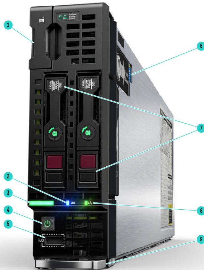
HPE ProLiant BL460c Gen10 Server Blade – Front View

Scale business performance and securely drive Traditional and Hybrid IT workloads across a converged infrastructure with the new HPE ProLiant BL460c Gen10 server blade for HPE BladeSystem. The HPE ProLiant BL460c Gen10 server blade helps drive new applications, turbo charge performance and transform into an agile, secure foundation, which with HPE OneView, places you on the path to Composable Infrastructure.